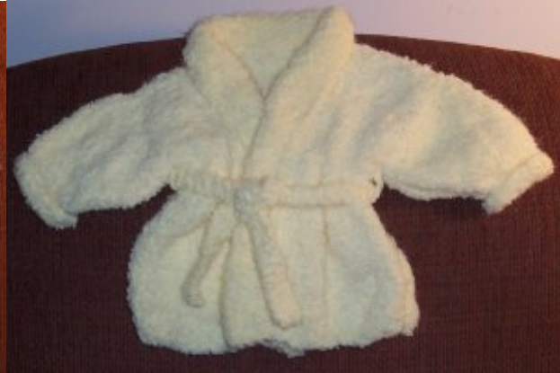
Paton's Be Mine